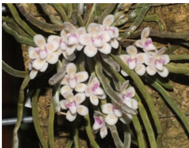
Vdps. shanica