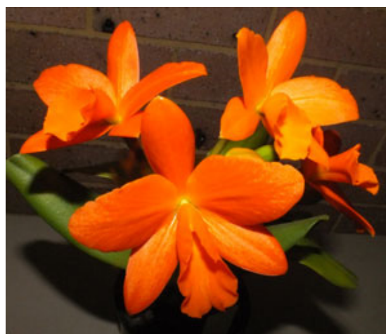
Rth. Hsinying Orange Nugget x Shindong Queen (V Petrovski)