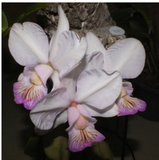
Catt. nobilior (A Alanati)