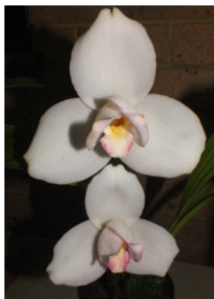
Lyc. Hanamikouyi