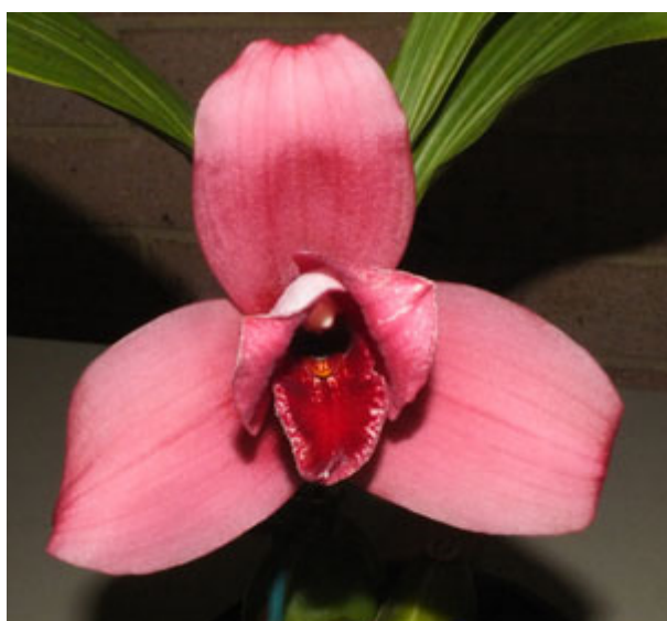
Lyc. Wildfire (L Valli)