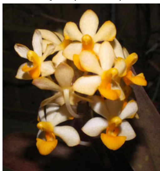
Asvts. Prapin (A Zderic)