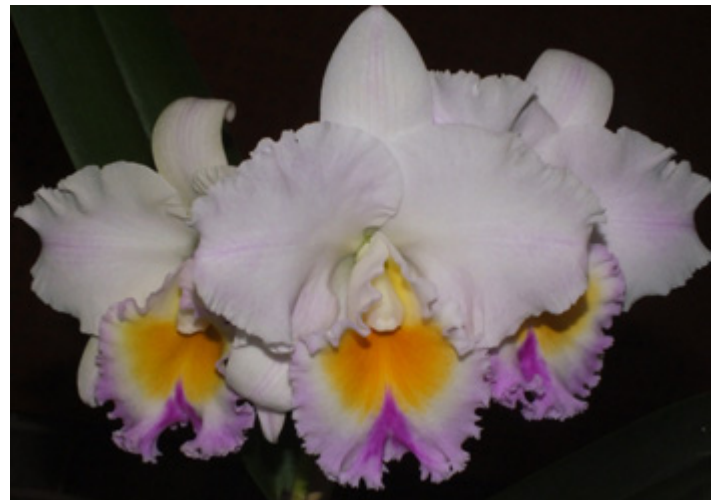
Blc. California Girl 'Orchidlibrary' (V Petrovski)