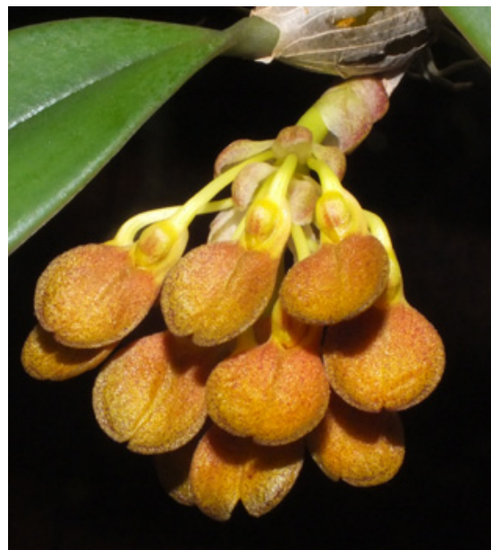
Bulb. spathulatum