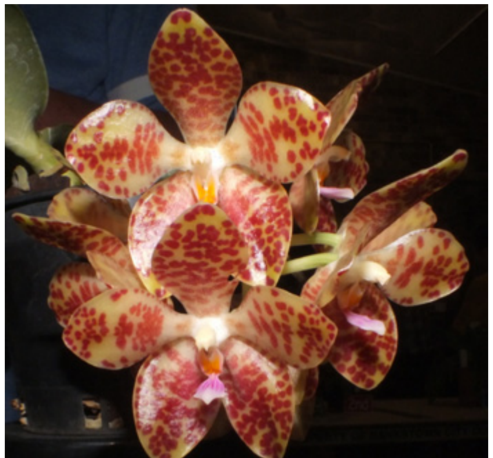
Phal. gigantea