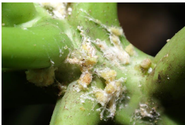
Mealy Bug eggs

White cottony mass or gray, brown, blackish crust on underside of leaves, on flower stem, in axils of leaves etc is probably Mealybug or one of the many scale insects. Scrub with soft toothbrush.