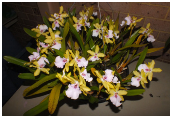
Plant of the Night: Milt. Yellow Spectacle (R Cawley)