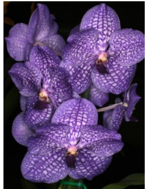
V. Somsri Glory Blue owned by D&K Mitsios