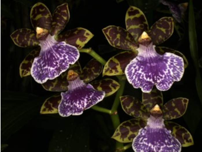
Champion any Other Genera Z. Blue Lake 'Atlantis' (D&K Mitsios)