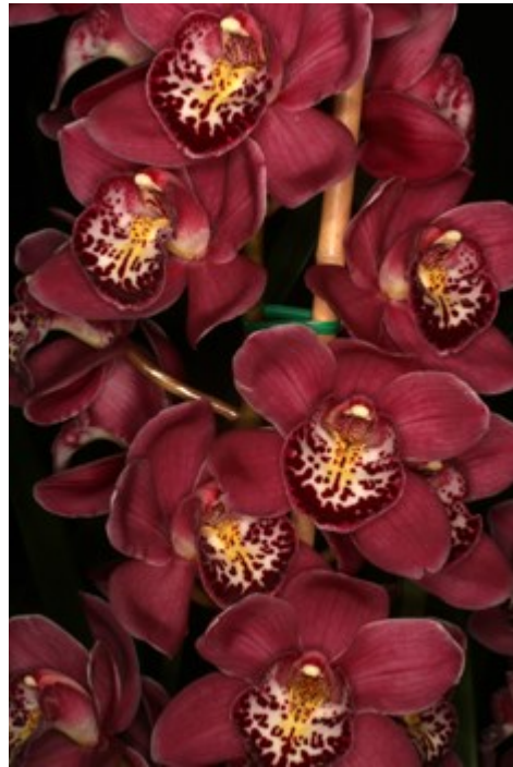
Champion Cymbidium Cym. Pink Celebration (D&K Mitsios)