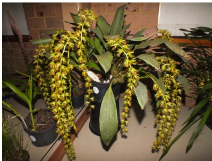
Plant of the Night