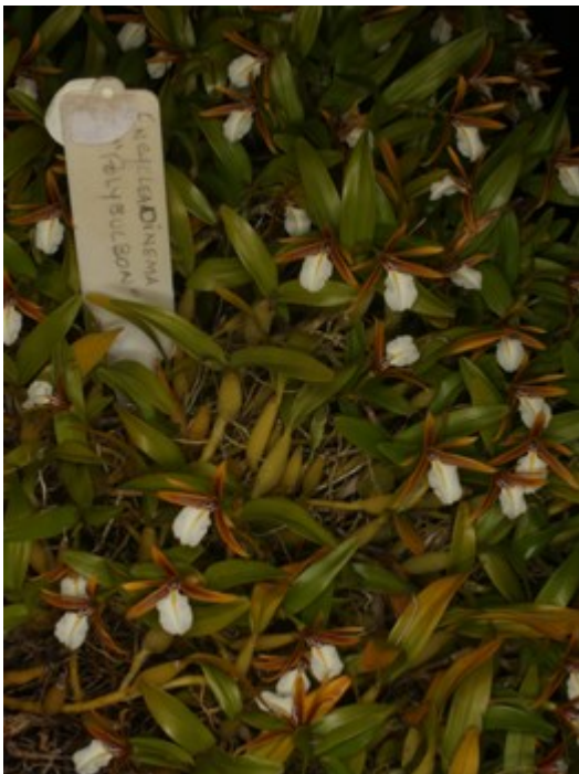
Champion Species Dinema polybulbon