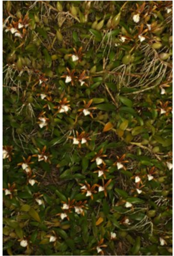
Champion Specimen Dinema polybulbon