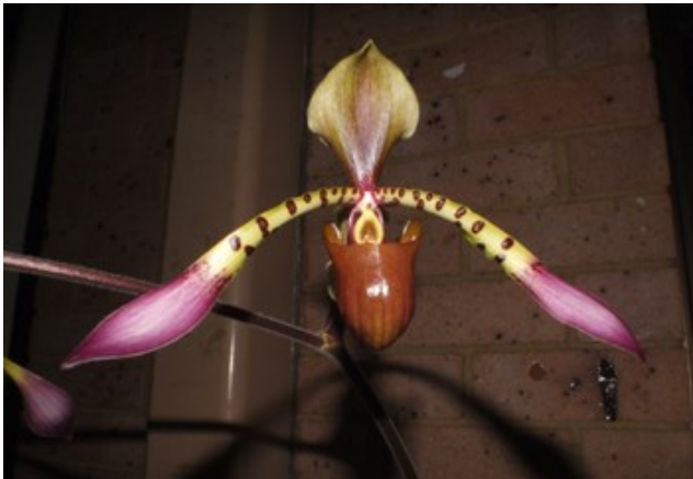
Novice Plant of the Night: Paph. lowii (A Alanti)