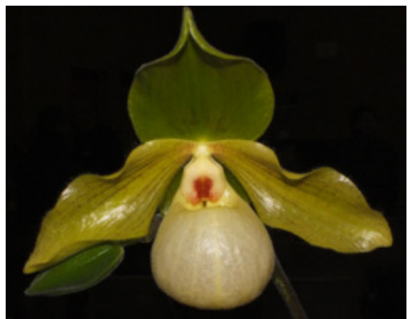
Paph. Pinnocchio x malipoense