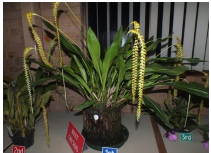
Plant of the Night: Ddc. macranthum (R Cawley)