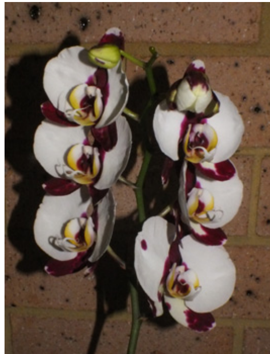
Phal. Black Magic

I have been growing Phalies via this method for more than 10 years and it works for me - the grass method works especially well for dendrobiums, cymbidiums, vandas and phalies. I like to use my own orchid mix for potting up and find that works well. I now grow orchids to sell but I like so many of them I want to keep them all!